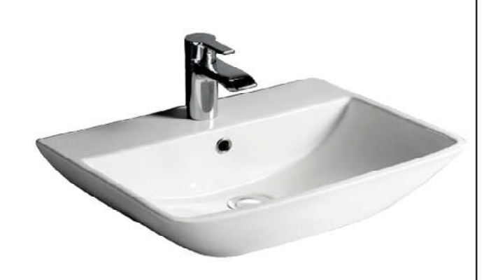
Faucet not included